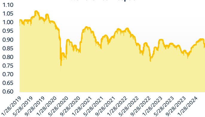
NAVPU Since Inception