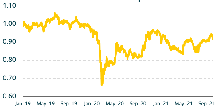
NAVPU Since Inception